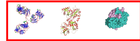
Infectious disease-associated biomarkers: New targets